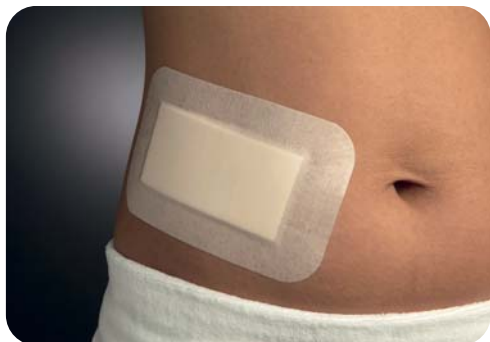
Position the dressing on the skin without stretching and gently remove the rest of the release papers. Firmly smooth adhesive border to obtain proper adhesion. Do not stretch the dressing when applying!

Frequency of change: The frequency of dressing changes will be governed by the condition of the underlying wound. Upon removal grasp the edge and slowly peel the dressing from the skin in the direction of hair growth.