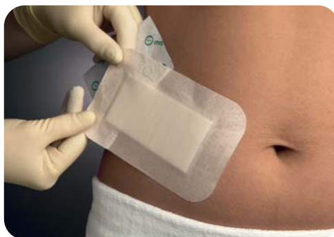
Grip both overlapping release papers, exposing adhesive surface allowing initial fixation of the dressing.