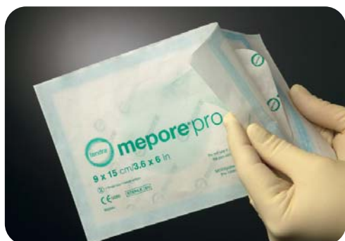
Open package and remove the dressing.