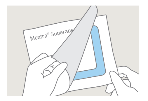
1. Clean the wound area and select a suitable size of Mextra® Superabsorbent.